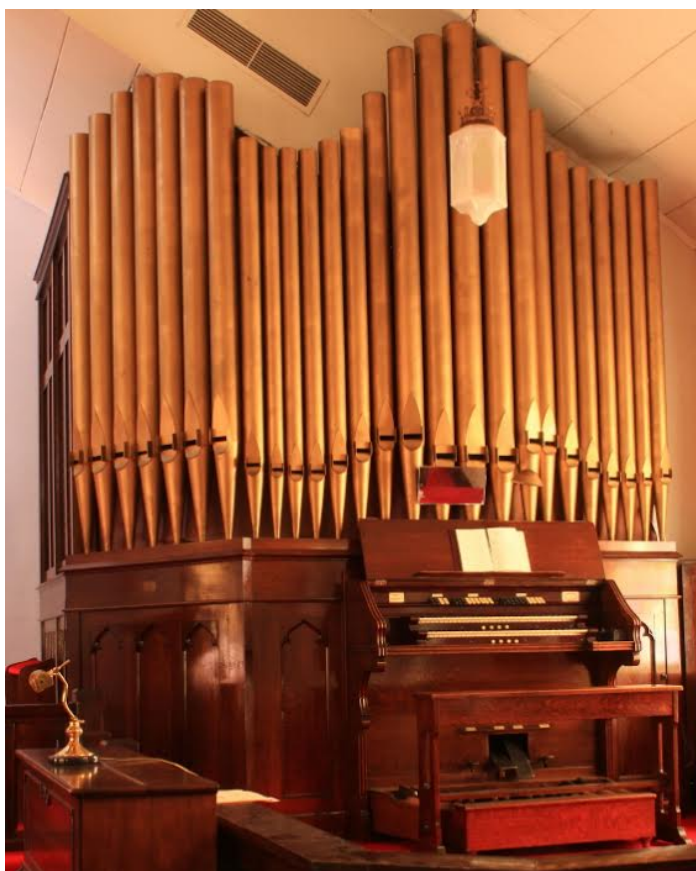
Organ at Cross Lutheran, Omaha