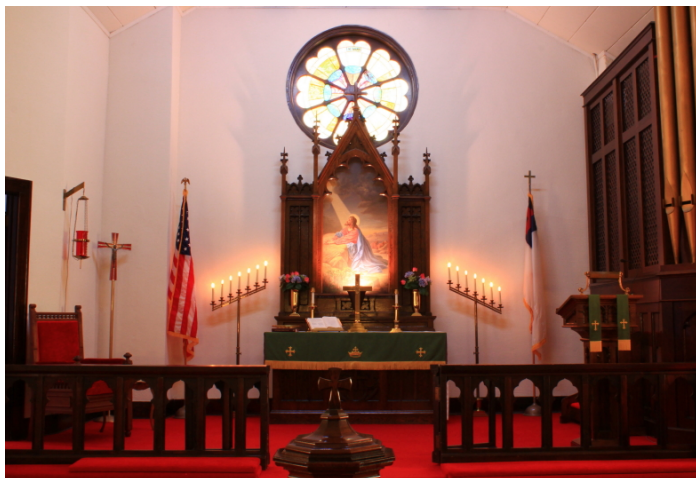
Sanctuary at Cross Lutheran, Omaha