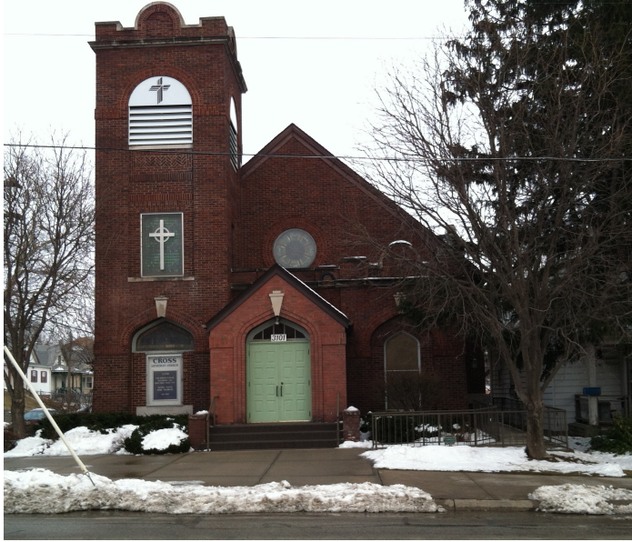
Cross Lutheran Church, Omaha